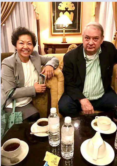
Photo with Nobel Laureate Dr. Ferid Murad

today. The BE business has given me the opportunity to continue to give back to society by helping more people to become leaders, to build their career, and enjoy health and a happy life."