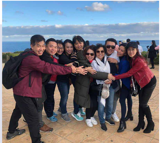
Dinner with Founders and uplines