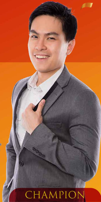
CHAMPION RCCA TY LOW