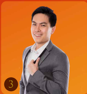
RCCA TY LOW