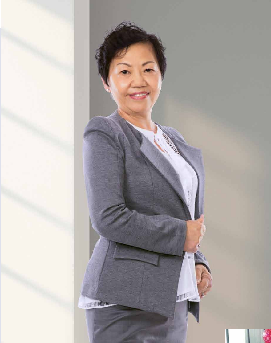
Sharing at a BES