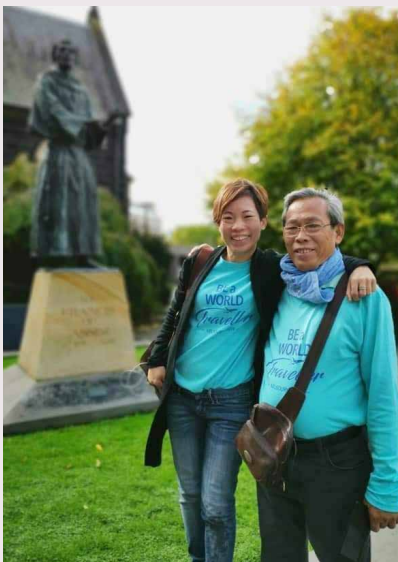
BE Lifestyle Travel to Melbourne