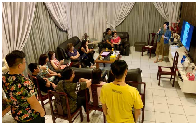
The "One Family" culture

It is normal for MLM newbies to struggle and adjust their mindset, especially if they used to work inside a cubicle. And initially, rejections can easily dampen their spirit.