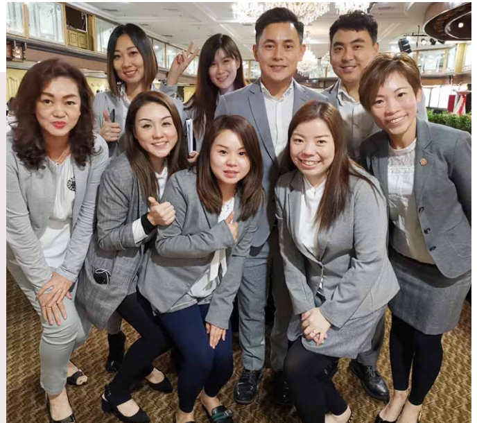
Photo with uplines